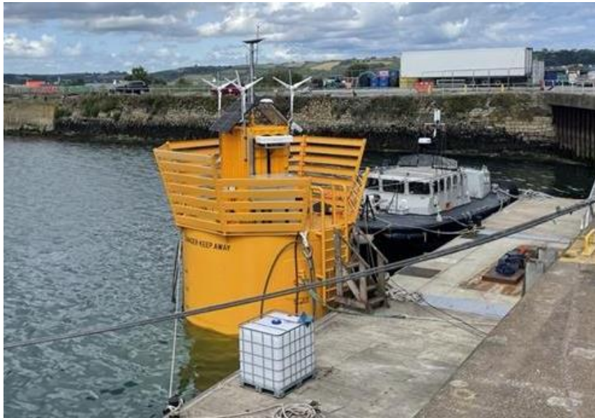
Photo of platform in the water demonstrating the in-water profile.

The device will be lit with a Flash character of Fl (5) Y 20s. The device will be in place for the months of July, August and September and will be removed from site in October.